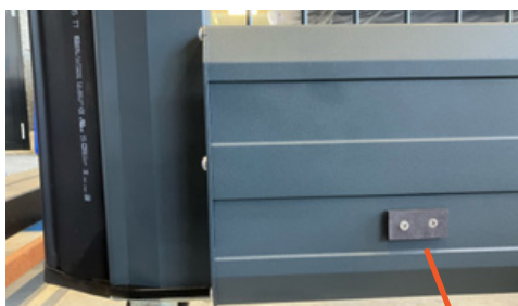
lower recess of the lower beam